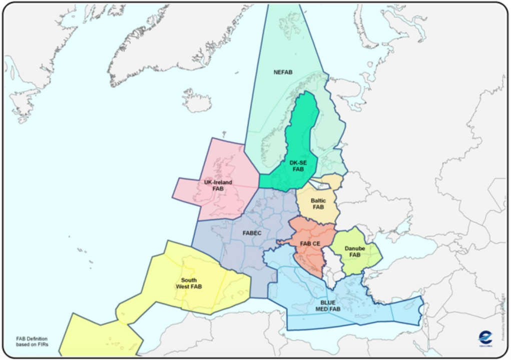
Figure 2: The Functional Airspace Blocks.

Under the SES legislation, national air traffic control organizations would work together through nine regional airspace blocks (FAB's) leading to efficiency gains, cost reductions, emission improvements and safety benefits. The FAB's are designed to take into account traffic flow rather than state boundaries (Figure: 2).